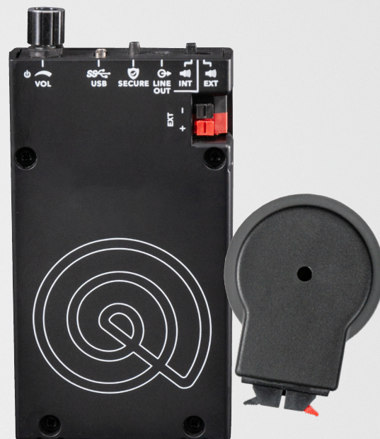
▲ The VMG-2 can be paired with TSSLLC's Heavy Emitter to put voice mask energy into structural elements like pipes, windows, and door frames.

In addition to several external volumetric speakers and heavy emitter transducers, multiple mounting options — temporary and permanent — are available for both the VMG-2 and emitters.