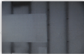
Studs inside wall.