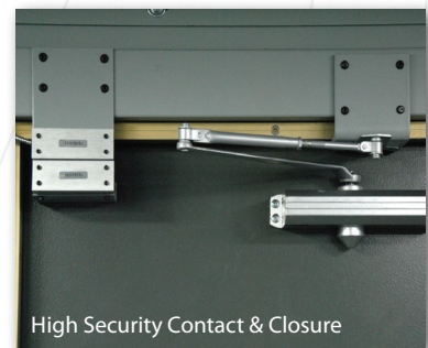
High Security Contact & Closure