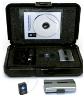
GeoView travel kit with Garmin 10 GPS receiver.