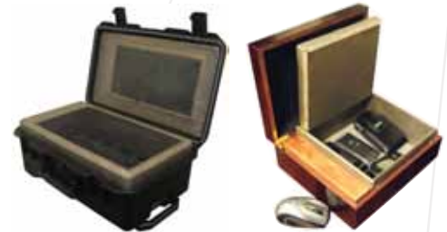
Portable and Desktop Versions Also Available

With a table top, floor model, and now travel model available, the PED Vault is placed inside a SCIF or other secure area and is connected to a standard 110 /220VAC electrical outlet.