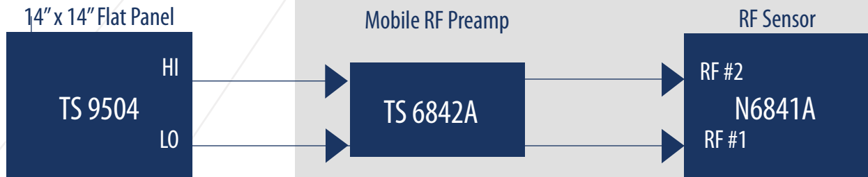
(Fig 2) Typical Interconnection Diagram