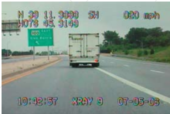
Reference the exact location of any videotape recording with this highly intuitive unit.

GeoVision includes Windows based controller software to configure all data fields. The utility uploads all setting via the RS-232 serial port to GeoVision's non-volatile memory. Customize GeoView's data to meet your exact operational needs.