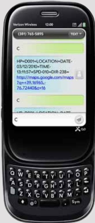
Simple text commands are used to query the CP-100T

The CP-100T requires no service fees or contracts. Simply supply your own SIM card from T-Mobile or other GSM cellular carrier and you are ready to begin tracking! Call us today for complete details or if you have any questions.