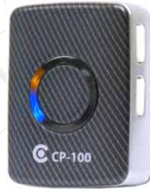
"The smallest, on-demand GPS tracking device available."