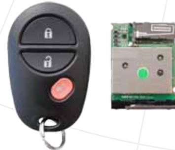
The unique antenna design provides full omni-directional coverage.